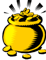
Pot of Gold

We wanted to adapt the policy to provide an opportunity to recognise those children whose behaviour goes above and beyond what is expected as well as providing a system where inappropriate choices are redeemable. The 4 stage system is as follows